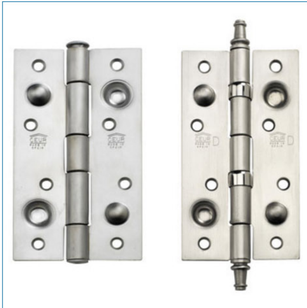
904 SF MATT CHROME and 905 LF STAINLESS COATED