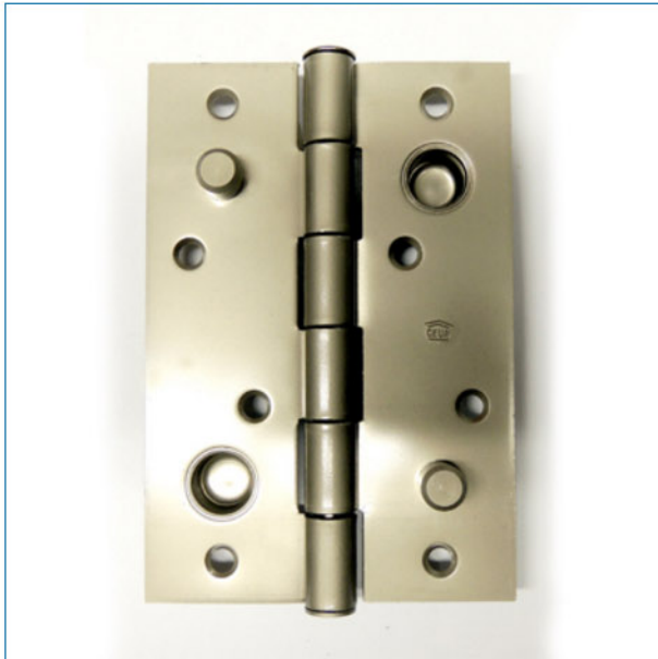
9041 MATT NICKEL