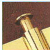
SF - Short Finish