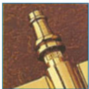
LF - Long Finish