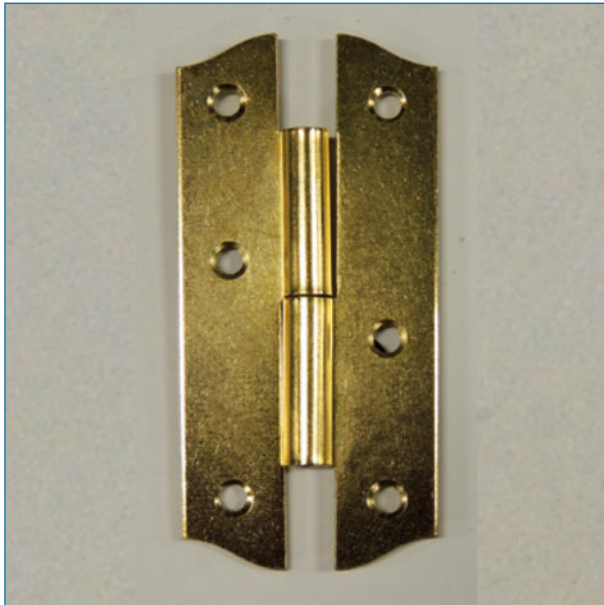
PERNIO 395-4 LATONADA